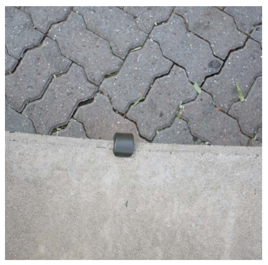
Frederick Khalil, 2011